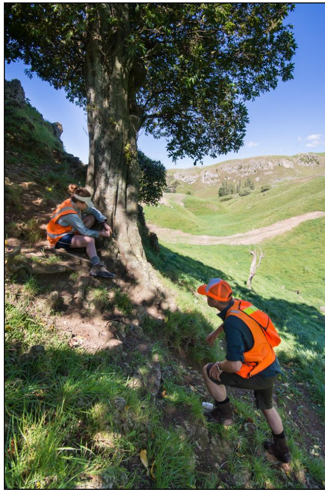
LCR staff during biodiversity monitoring field trip.