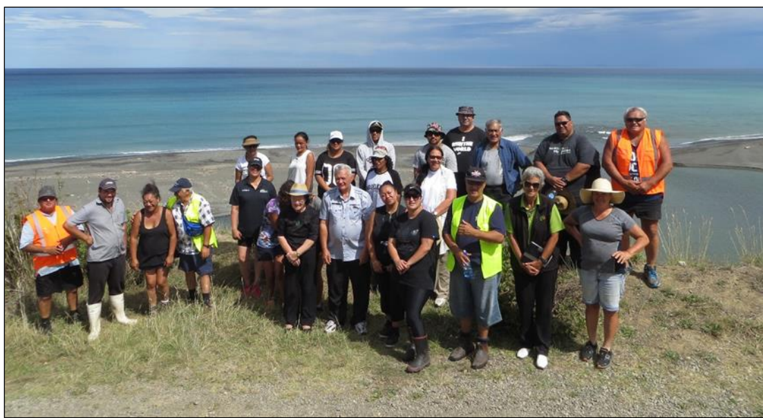
Staff and Whanau at Mohaka River Mouth.

We have always been clear in our aim for ‘Te Oranganui o Ngāti Pāhauwera’ – the health of Ngāti Pāhauwera. Ngāti Pāhauwera are leaders in our rohe, in that we were the first in Hawke’s Bay to settle our Treaty claim. It has always been about the protection of and looking after our natural resources and people. The ‘reti board’ is an innovative Ngāti Pāhauwera creation still used today to catch the world-famous Mohaka kahawai – which is why we use it in our logo. Our intention is to grow our people and our assets using collaboration and innovation.