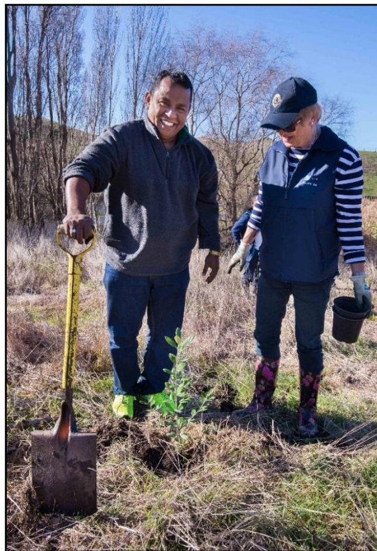
Planting day at the Clifton County Cricket Club.