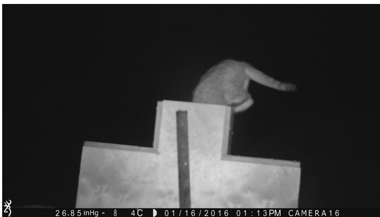
Cat entering a trap during the PAPP trial at Toronui station.