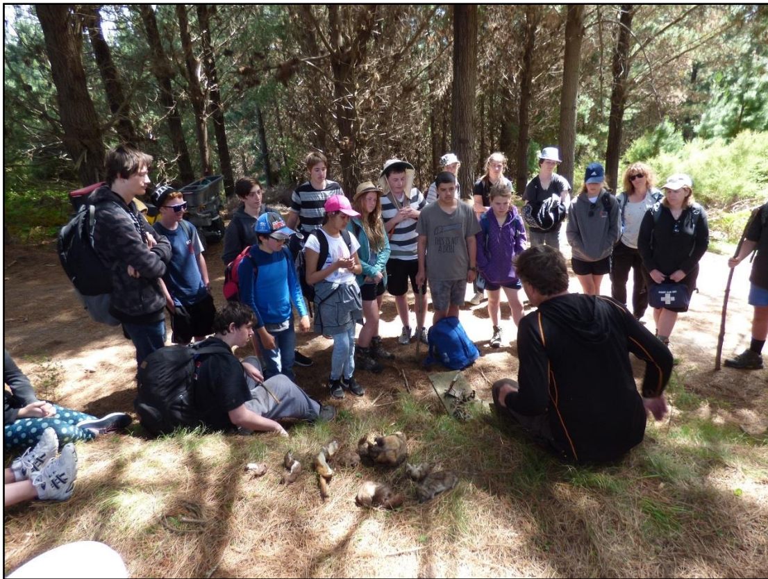
Taikura Rudolf Steiner school students during a Cape to City education programme.