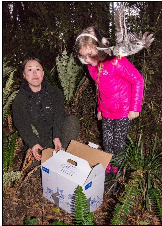
Toutouwai release into 100 Acre Bush.