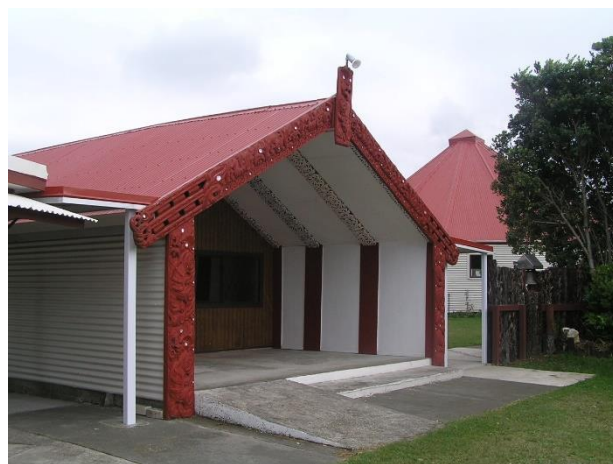
Waipapa A Iwi Marae - Mohaka

Ko Tawhirirangi te maunga Ko Mohaka te awa Ko Te Kahu o Te Rangi te tangata Ko Paikea te taniwha Harara Taupunga Opunga Te Huki, Hiruharama nga urupa Ko Rongomaiwahine te whare porotiti Ko Ngāti Pāhauwera te iwi e