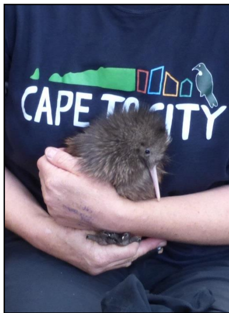
Juvenile kiwi being released at the Cape Sanctuary during a Cape to City education programme.

Native species thrive where we live, work and play